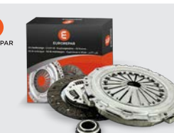
CLUTCH KIT FORD FIESTA MK II (1983-1989)