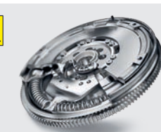
CLUTCH KIT DACIA LOGAN (2004 ON)