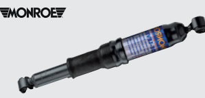
SHOCK ABSORBER FRONT TOYOTA AYGO I (2005-2014)