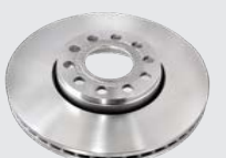
BRAKE DISC FRONT (SINGLE VENTED) BMW 3 SERIES E90-93 (2005-2014)