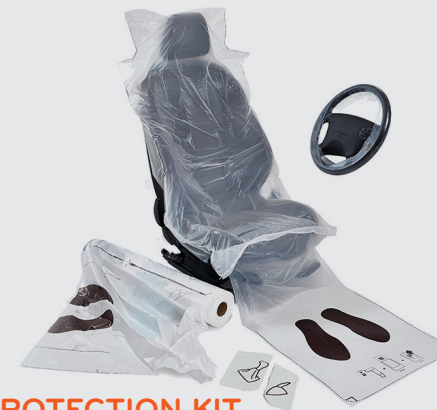
5 IN 1 PROTECTION KIT BOX OF 100