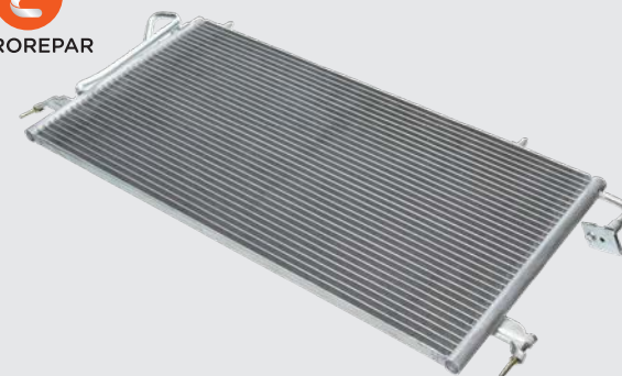
AIRCON CONDENSER MITSUBISHI OUTLANDER II (2006-2012)