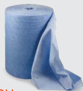
BLUE ROLL WORKSHOP ROLL - BLUE (6 PACK)