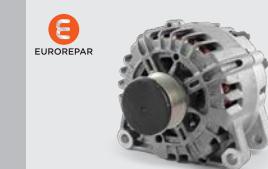
ALTERNATOR REFURBISHED - (1.4P) 120 AMP CITROËN C4 (2011 ON)