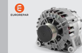
ALTERNATOR REFURBISHED - (1.0P) 70 AMP PEUGEOT 107 (2005-2014)