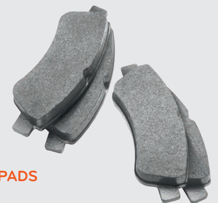
BRAKE PADS FRONT RENAULT CLIO II (1998-2005)