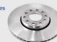
BRAKE DISC FRONT (SINGLE VENTED) RENAULT MEGANE I (1995-2004)