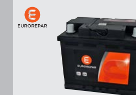
BATTERY 027 DS4 (2011 ON) EUROREPAR 3 YEAR GUARANTEE