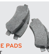
BRAKE PADS FRONT FORD TRANSIT CONNECT (2002-2013)