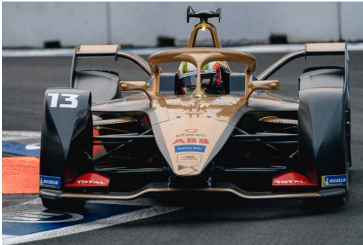
DS Auto Automobiles, Formula E Championship