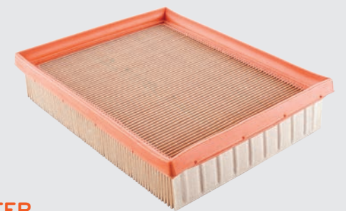
AIR FILTER (1.4D) TURBO DIESEL FORD FIESTA MK V (2002-2008)