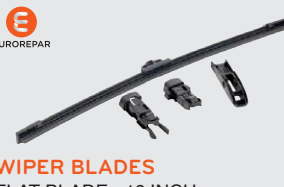
WIPER BLADES FLAT BLADE - 16 INCH HYUNDAI I10 (2013 ONWARDS)