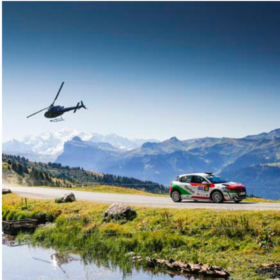
Peugeot 208 Rally, Rali de Castelo

18 Here to keep you safe Distrigo are here to keep you and your customers safe.