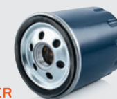
OIL FILTER (2.0P) VOLKSWAGEN GOLF MK V (2003-2008)