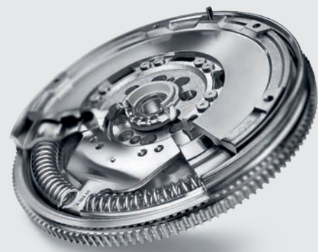
CLUTCH KIT FORD FOCUS (1998-2004)