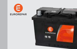
BATTERY 096 DS5 (2011 ON) EUROREPAR 3 YEAR GUARANTEE