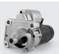
STARTER MOTOR NISSAN QASHQAI (2006-2014)