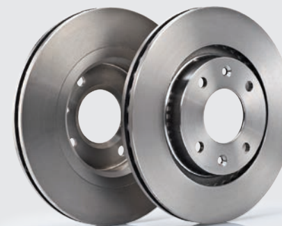
BRAKE DISC FRONT (PAIR VENTED) FIAT DOBLO (2009 ONWARDS)