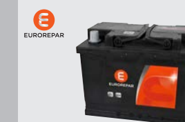
BATTERY 079 DS3 (2009 ON) EUROREPAR 3 YEAR GUARANTEE